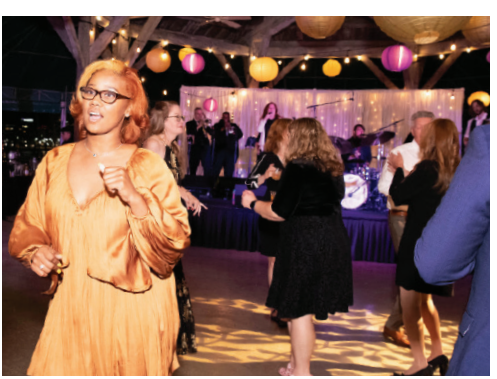
Reverend Smackmaster and the Congregation of Funk brought party-goers to the dance floor all night long.