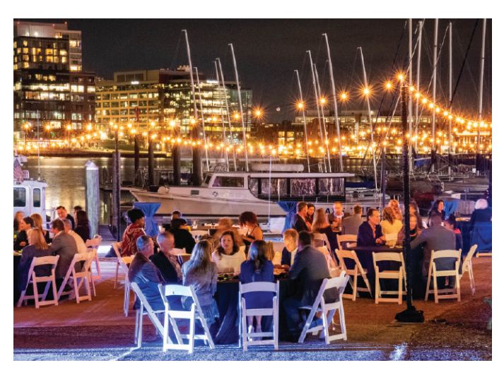
A beautiful evening with spectacular waterfront views provided the perfect backdrop.